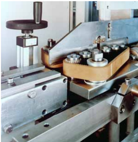
The belt drive mechanism on a HardLine Centerless Continuous heat treatment machine.

full range of maintenance, logistics, training and spares services. Make the most of your heating system—with a little help from the people who built it.