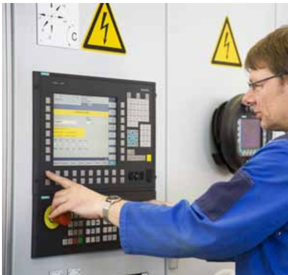
A typical operator terminal from a HardLine centerless heat treatment system. Our control systems are built on platforms from one of the world's most trusted suppliers.

Standard EFD Induction CC machines feature a High-Speed Control solution with a reaction time of only 1 \mu s. An ultra-accurate sensor—that is easily mounted in front of or behind the inductor—detects the workpiece edge and controls the hardening program. This enables safe and reproducible heat treatment of completely plain shafts without journals, even with narrow hardness tolerances at high line speeds. The control terminal is easy-to-use, featuring a 12" screen, multilingual displays and online documentation via the control PC. Options include printer capability, and an Energy Measuring System that stores key energy consumption data.