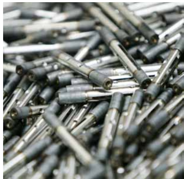
High throughput and consistent heating outcomes are essential when heat treating bars and shafts. Left, a HardLine Centerless Pusher hardens steel bars.