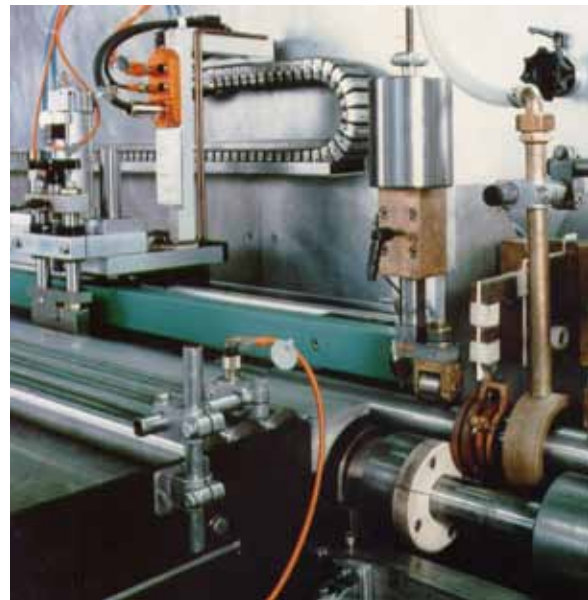
A close-up of the pusher mechanism on a HardLine Centerless Pusher heat treatment machine. This version features a lifting device.

EFD Induction has to date installed thousands of heating solutions for a vast range of industrial applications—bringing the benefits of induction technology to many of the world's leading manufacturing and service companies. EFD Induction has manufacturing plants, workshops and service centers in the Americas, Europe and Asia.